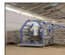
RAFFINA - WOVEN SACKS