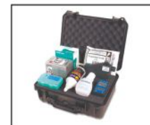
OPTICAL FIBER GRADE