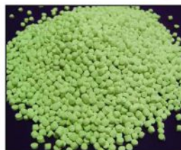
OPTICAL BRIGHT MASTERBATCHES