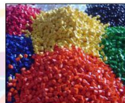
COLOUR MASTERBATCHES SPC (MONOPIGMENTRY) CUSTOM COLOURS