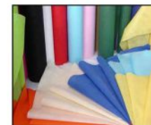
PP - NON WOVEN