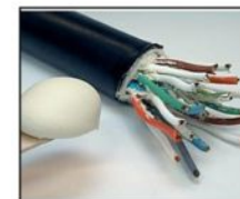
JELLY FILLED TELEPHONE CABLES