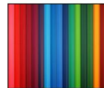
MULTI & MONO LAYER FILMS