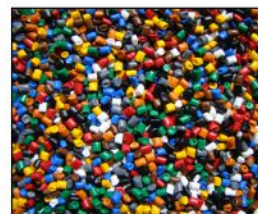
COLOUR MASTERBATCHES SPC (MONOPIGMENTARY) CUSTOM COLOURS