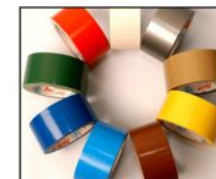
BOPP / PET