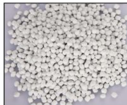
WHITE & BLACK MASTERBATCHES